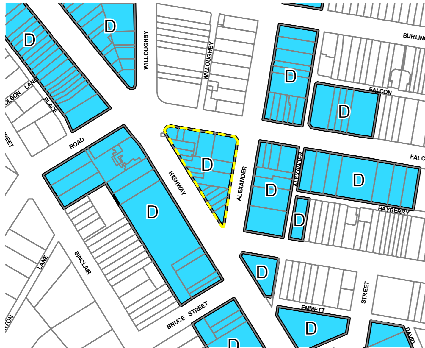
Existing Non Residential FSR (001) Map