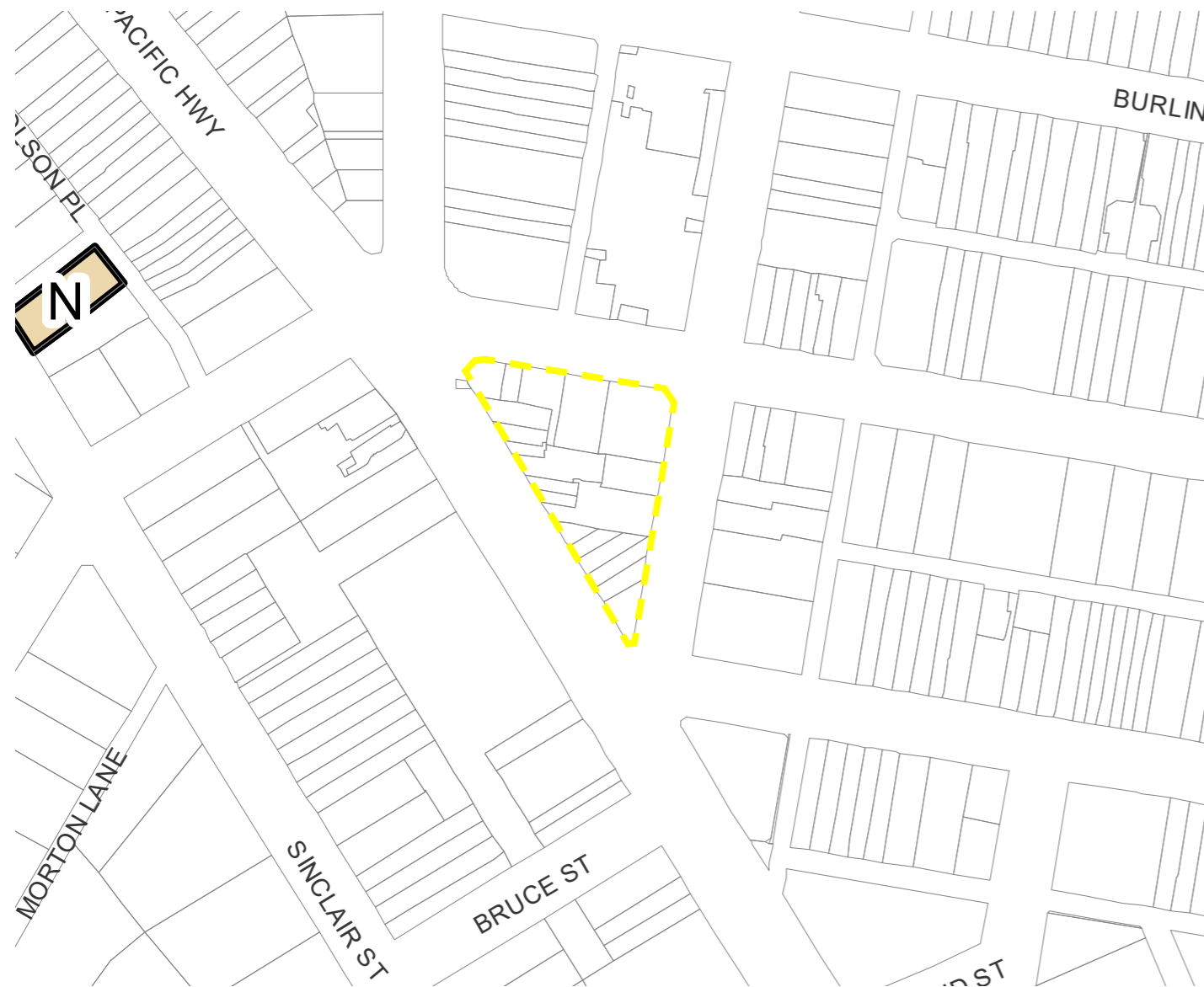
Existing FSR (001) Map