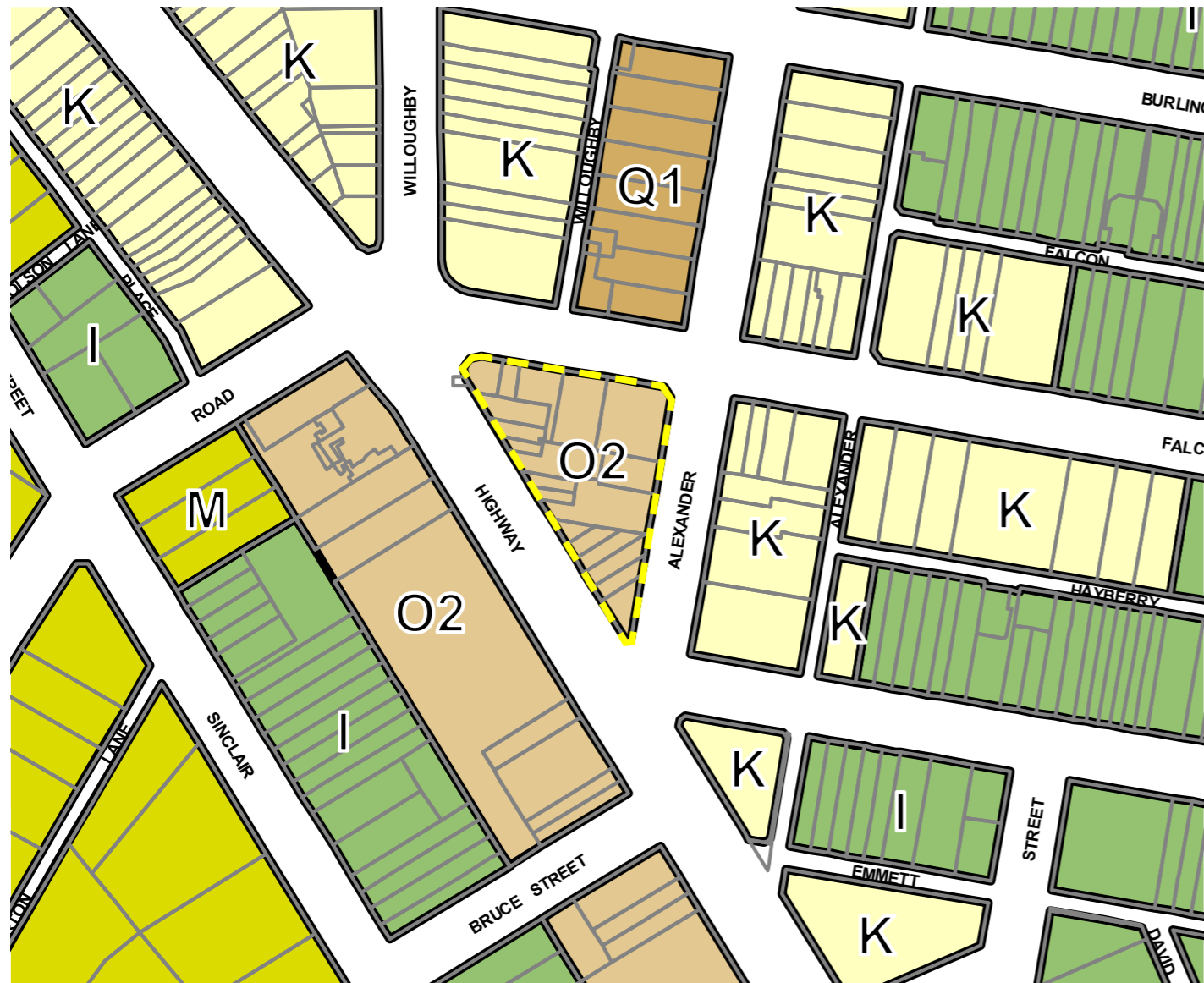
Existing HOB (001) Map

North Sydney Local Environmental Plan 2013 Height of Buildings Map - Sheet HOB_001