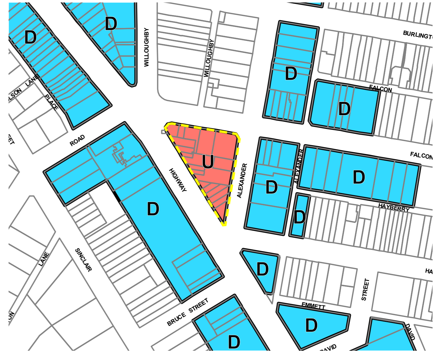
Proposed Non Residential FSR (001) Map